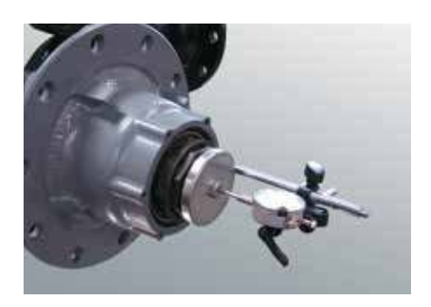
Fig. 3 – A typical end play gauge.