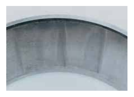
Fig. 1 - Outer race (cup) scalloping; uneven localized wear resulting from excessive end play.

pre-adjusted wheel end assembly can be serviced. Always refer to the manufacturer's service recommendations for specific service instructions.