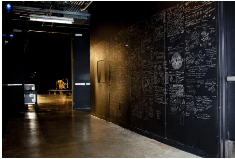
Backstage of the William and Nadine McGuire Theater

$10 rush tickets are available starting one hour before the show. Limit one ticket per person with valid student ID.