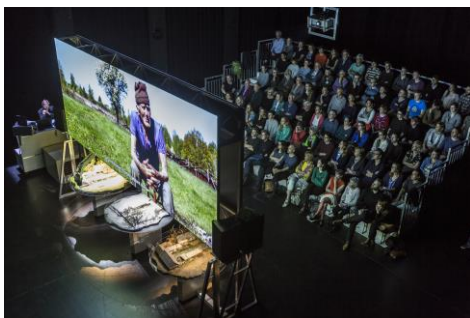
Berlin, Zvizdal

Copresented by the SPCO’s Liquid Music Series