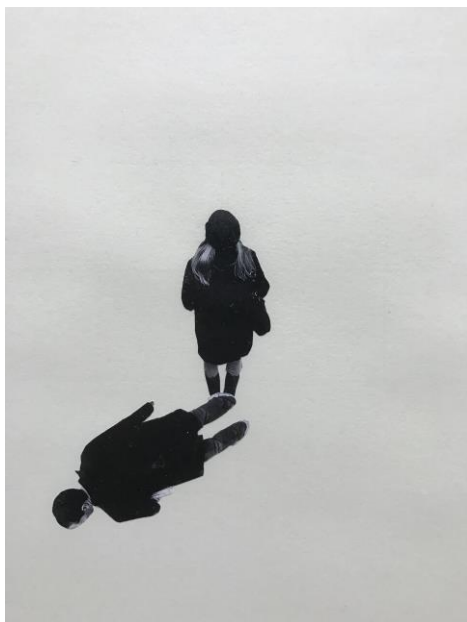
Rabih Mroué, Borborygmus .

MINNEAPOLIS, DECEMBER 7, 2018— From devastating events—war, prison, Chernobyl—come experimental performances of resiliency, compassion, and originality. Out There 19 features five cross-national, interdisciplinary groups of collaborators Lebanon/Germany, Brussels/Ukraine, Finland/US, Argentina/Britain, US/Rwanda. Throughout January, be inspired by the resourcefulness and creativity of international artists whose work eclipses borders, both real and imagined. Engage with live art that explores transformation with intensity and necessity, purpose and passion. Take a walk through an exhibition with a one-of-a-kind violinist. Get Out There onstage and in the galleries.