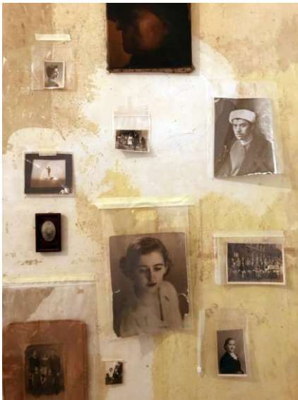
Rabih Mroué, Borborygmus . Photo courtesy the artist.

5–9 pm Opening of Again we are defeated , Gallery 2 7–8 pm Sand in the Eyes lecture-performance 8–8:30 pm Q&A with Rabih Mroué 8:30 pm Reception with the artist