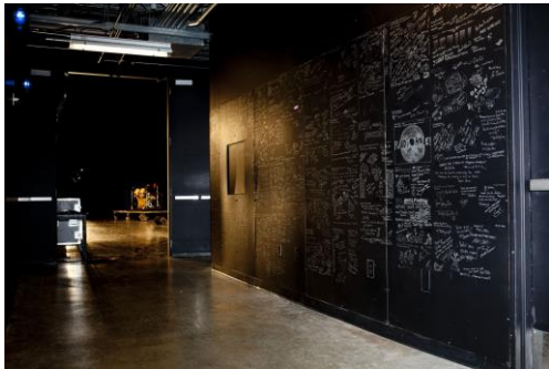
Backstage of the William and Nadine McGuire Theater