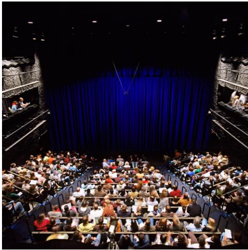
William and Nadine McGuire Theater

Sculpture Garden, in 2005 the Walker opened a $100 million expansion which housed dedicated venues for all its disciplines including the 385-seat McGuire Theater.