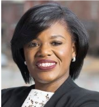
Cori Bush, State Co-Chair

Activist, Community Organizer, Nurse & Pastor