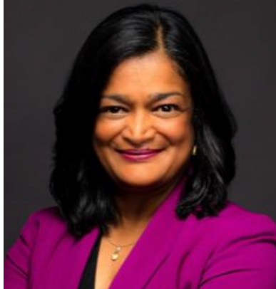
Pramila Jayapal, State Chair

U.S. Representative (WA-07) & Co-Chair, Congressional Progressive Caucus