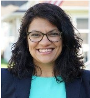
Rashida Tlaib, State Chair U.S. Representative (MI-13)

Bio: Born and raised in Detroit and the proud daughter of Palestinian immigrant parents, Rashida Tlaib represents Michigan's 13th Congressional District as a progressive warrior and one of the first Muslim women elected to Congress. Before being elected to Congress, Rep. Tlaib represented the 6th and 12th Districts of the Michigan House of Representatives.