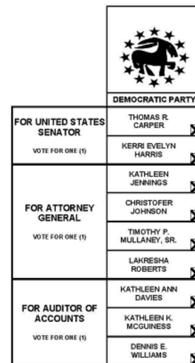
Sussex County, DE 2018 Democratic primary

Id. However, New Jersey models its primary election ballot design – which is in all instances held at the expense of the taxpayers under N.J.S.A. 19:45-1 – such that candidates for the same office are listed in different columns which may not even be adjacent, and candidates for different offices are listed in the same column: