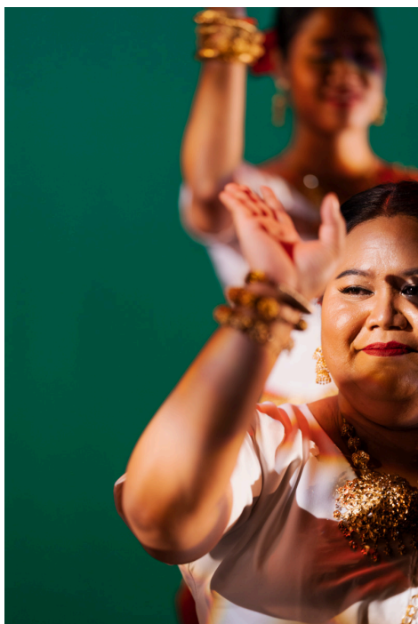
Wattanak Dance Troupe.