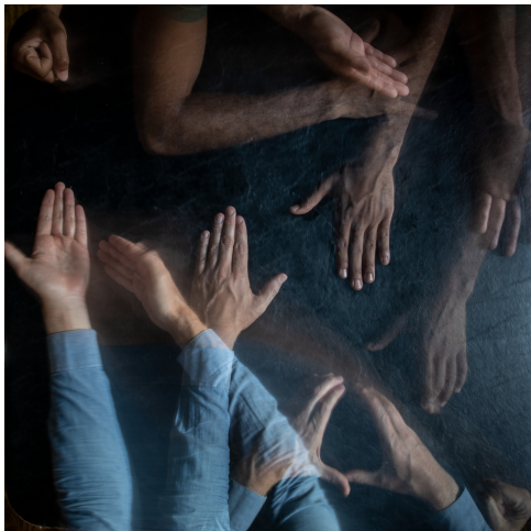
600 Highwaymen, A THOUSAND WAYS .

“[ A THOUSAND WAYS ] ... takes a simple premise and turns it into magic.” — The New Yorker