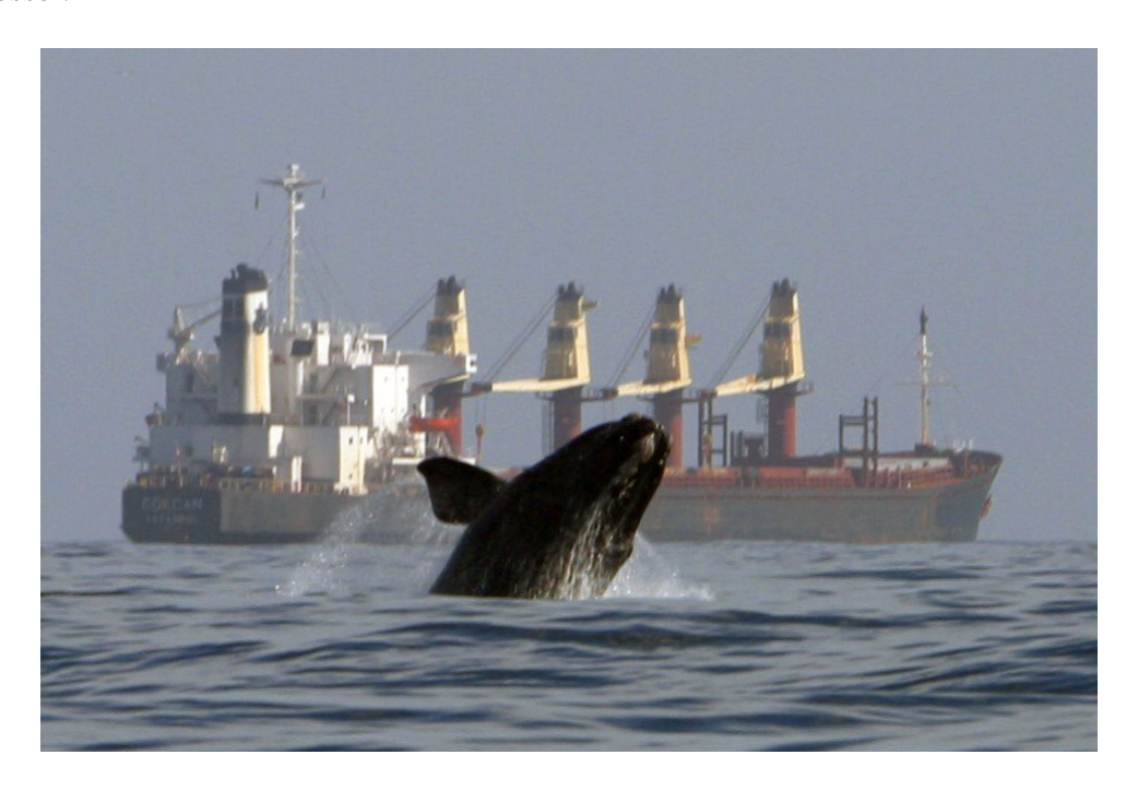
Florida Fish and Wildlife Conservation Commission

58. The right whale has a dark body, lacks a dorsal fin, and often swims mere feet below the ocean's surface, making it difficult for modern mariners to detect and avoid. Right whales may surface abruptly to breathe, directly in the path of a ship. Right whales resting, foraging, or socializing on the surface may be oblivious to large ships approaching because of the so-called "bow null effect" that blocks engine noise by the bow, creating a quiet zone in front of the vessel.