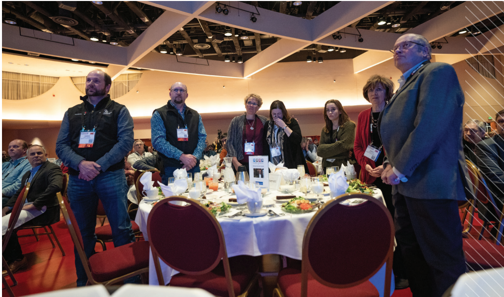
Dairy Strong is the premier event for progressive people in dairy.

“Farmers, allied businesses and organizations come together to learn, network and dive deep into discussions about challenges and opportunities. We celebrate, too. After all, we are part of the greatest industry in the world.”