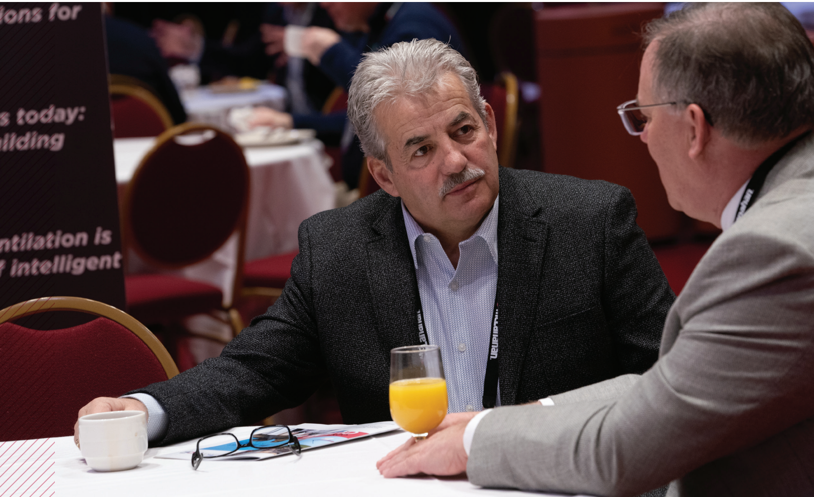
Dairy Strong brings together progressive stakeholders in the dairy community.