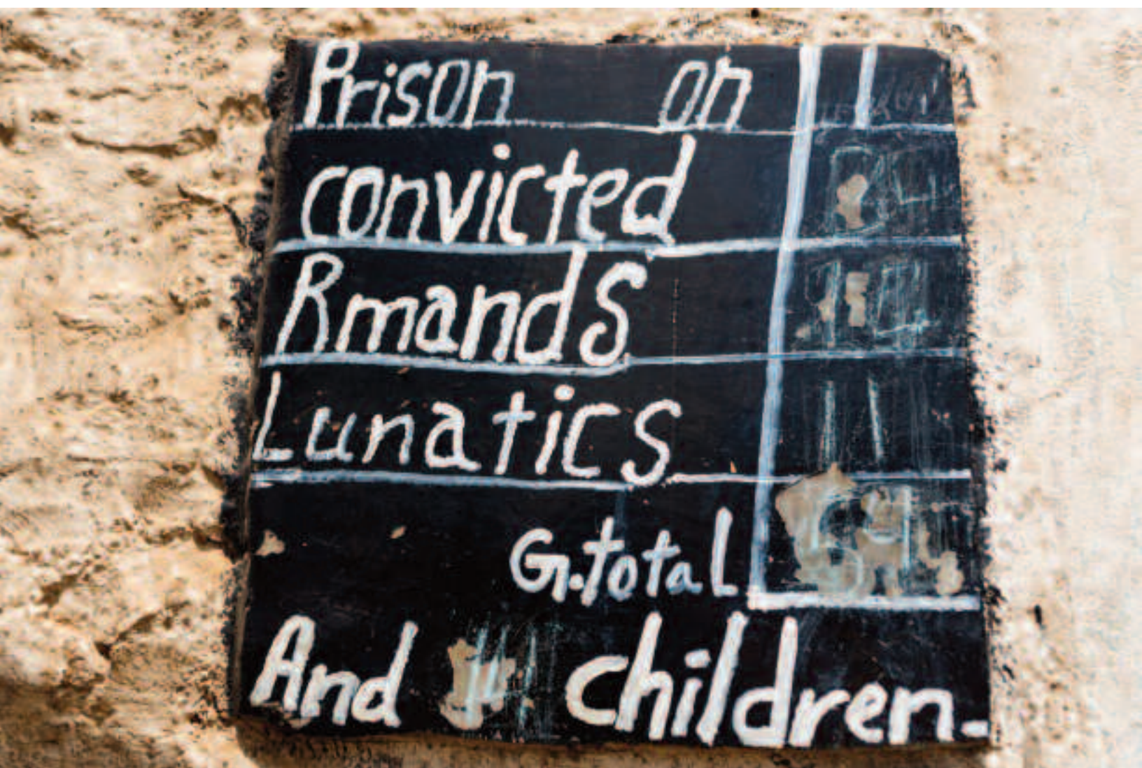
Sign showing the number of inmates in the women's section of Juba Central Prison.