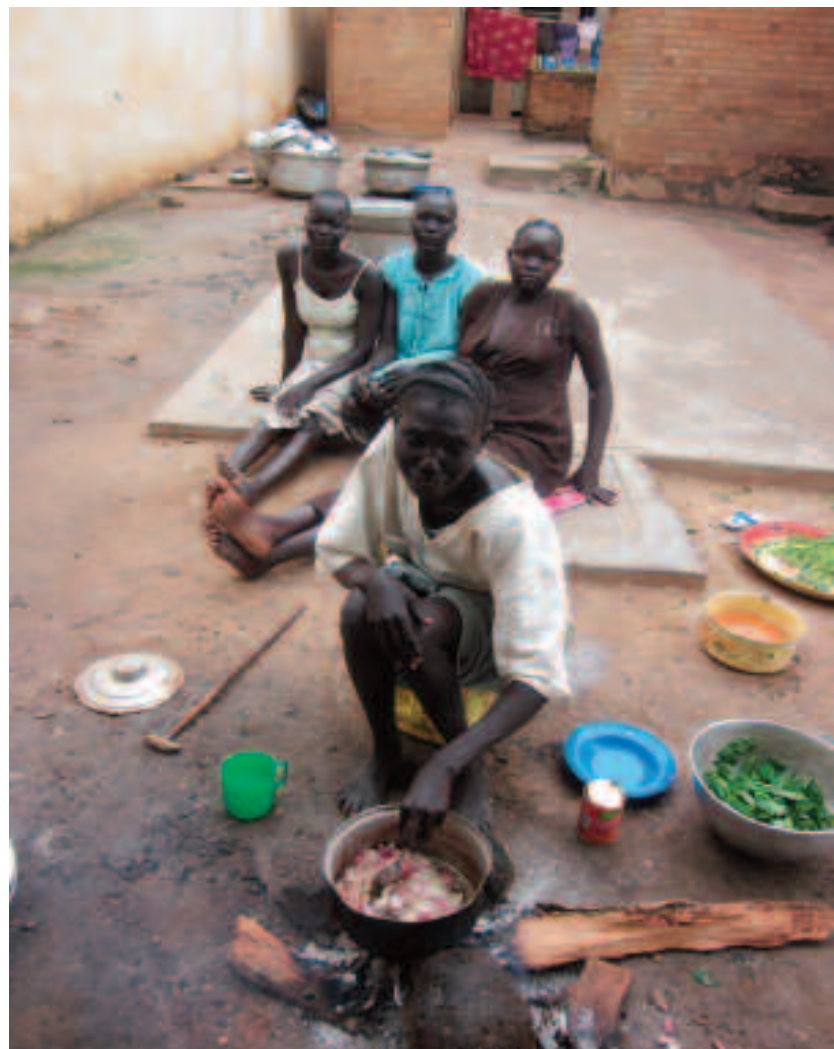
Rumbek Central Prison in Lakes State, South Sudan. Women make up a small number of the prison population and are expected to cook meals for more than 500 prisoners.