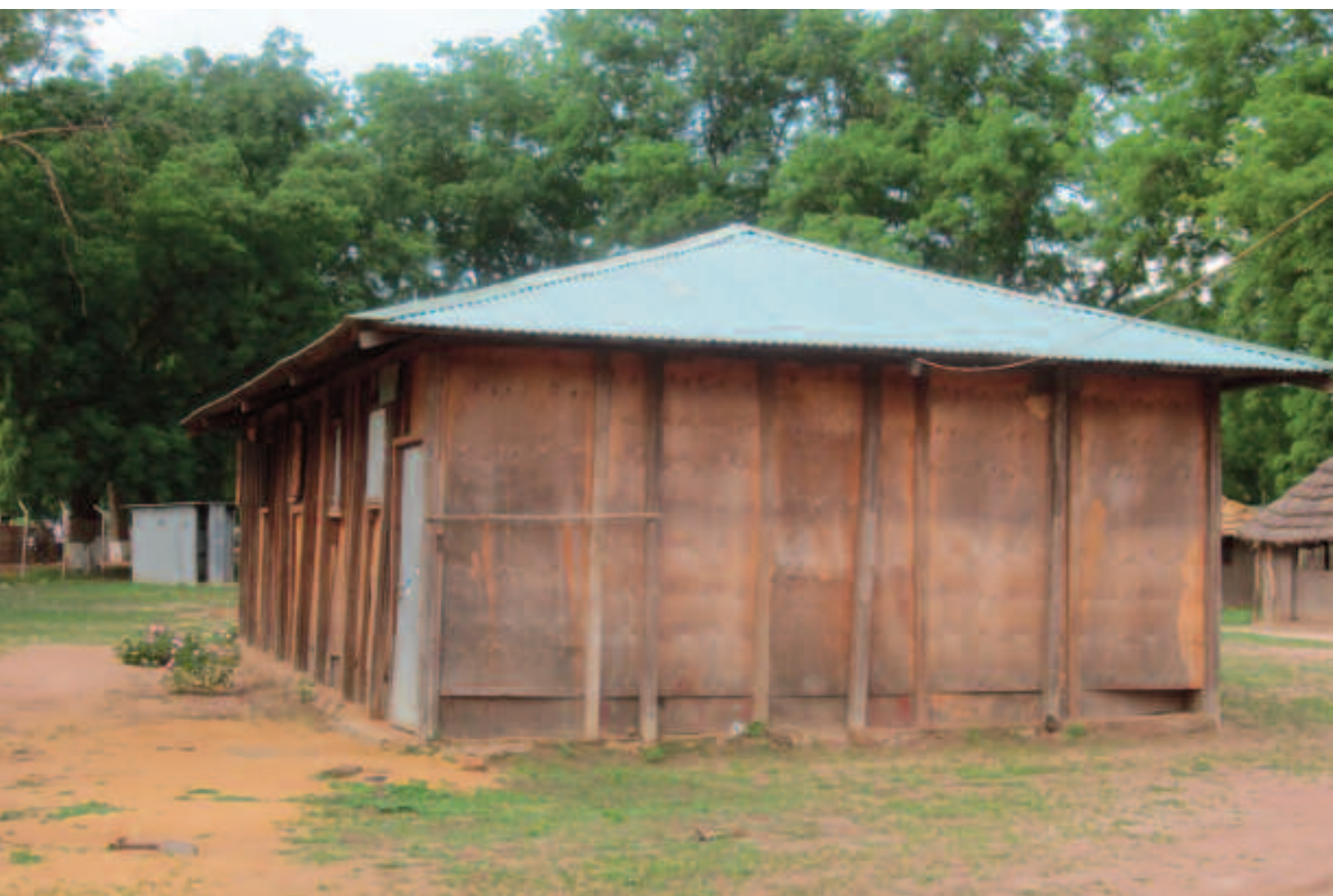
(above) The Lakes State High Court in Rumbek. South Sudan's statutory justice system faces numerous challenges, including inadequate court infrastructure, and staff shortages.