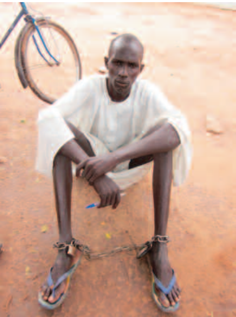
This 40-year-old man was put in shackles upon his arrival at Rumbek Central Prison. When Human Rights Watch met him, he had been in prison and chained for more than seven months while he awaited trial.