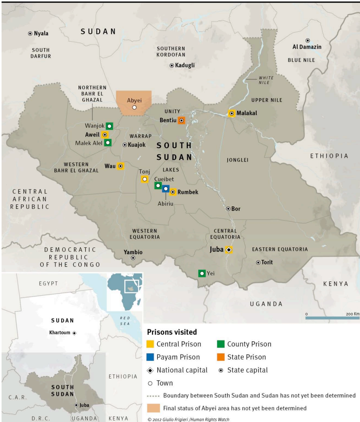
MAP: PRISONS VISITED BY HUMAN RIGHTS WATCH IN SOUTH SUDAN