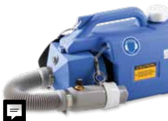
AQ-FG: Chemical Fogger, 110 V, 50/60 Hz AC ..... Call for Price AQ-FG-A: Chemical Fogger, 220 V, 50/60 Hz AC ..... Call for Price