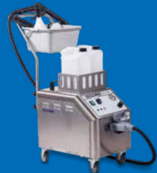
DRY STEAM SOLUTIONS