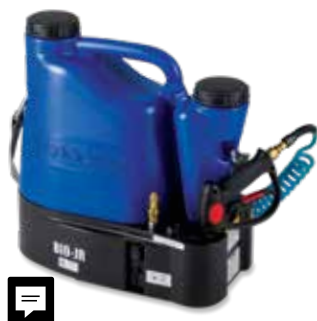
BIO-JR: BIO-JR sprayer, 10' self-coiling spray hose, spray gun with 18" wand, and a 25-degree spray nozzle ..... Call for Price