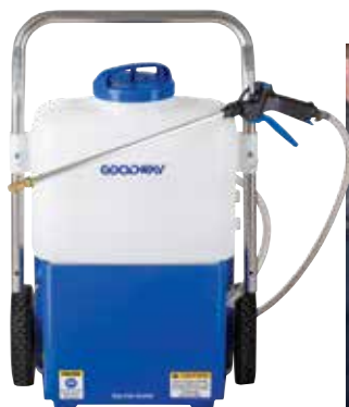
MP-50: The MP-50 sprayer includes sprayer, rechargeable battery and charger, 15' hose and adjustable nozzle ..... Call for Price