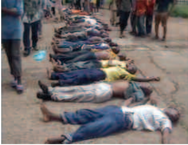
(top to bottom) The body of a victim of the September 28, 2009 massacre is carried away at the entrance to Conakry's main stadium.

This image taken immediately following the September 28, 2009 massacre in Guinea shows bodies of victims lying at the entrance to Conakry's main stadium.