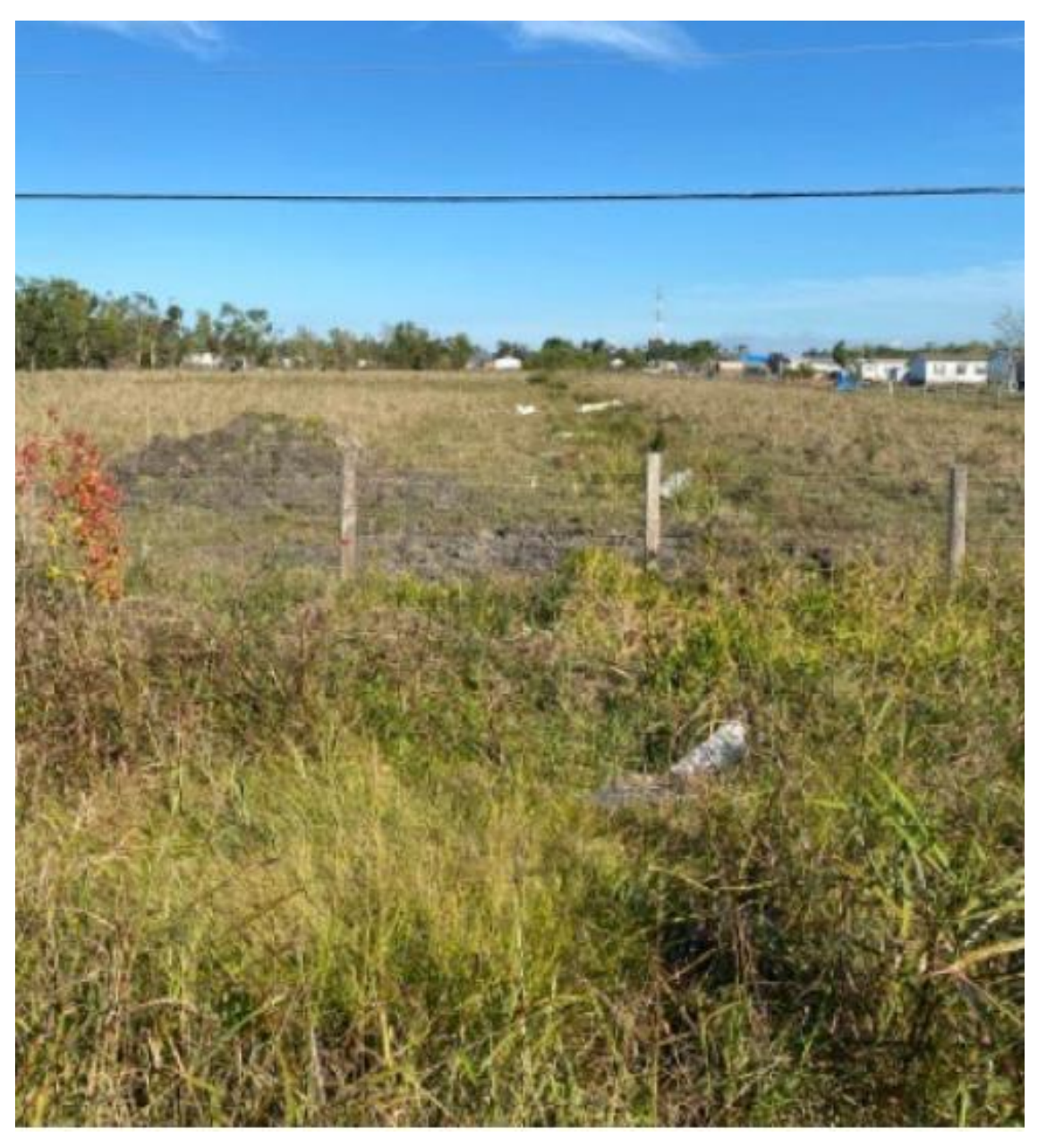
Figure 4: Photograph of Existing Site Conditions at the Proposed Triche Group Site Facing East