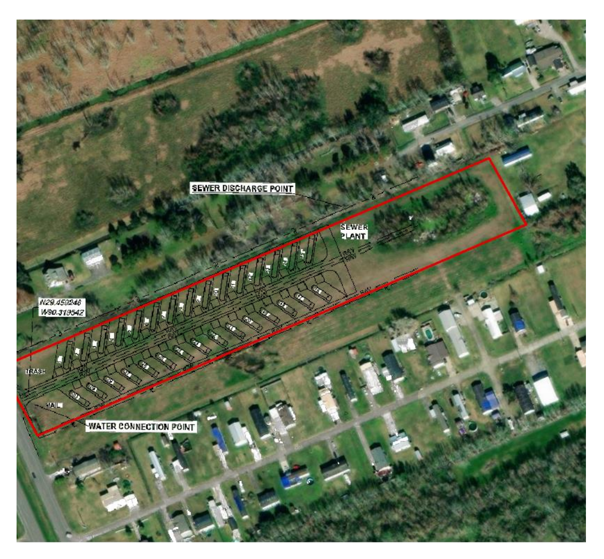
Figure 2: Triche Group Site Proposed Layout