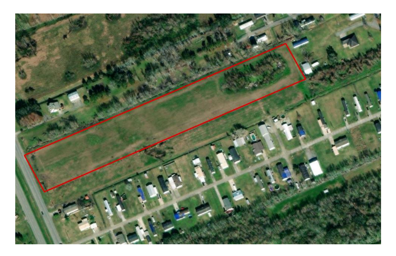
Figure 1: Aerial Photo and Vicinity of Proposed Triche Group Site