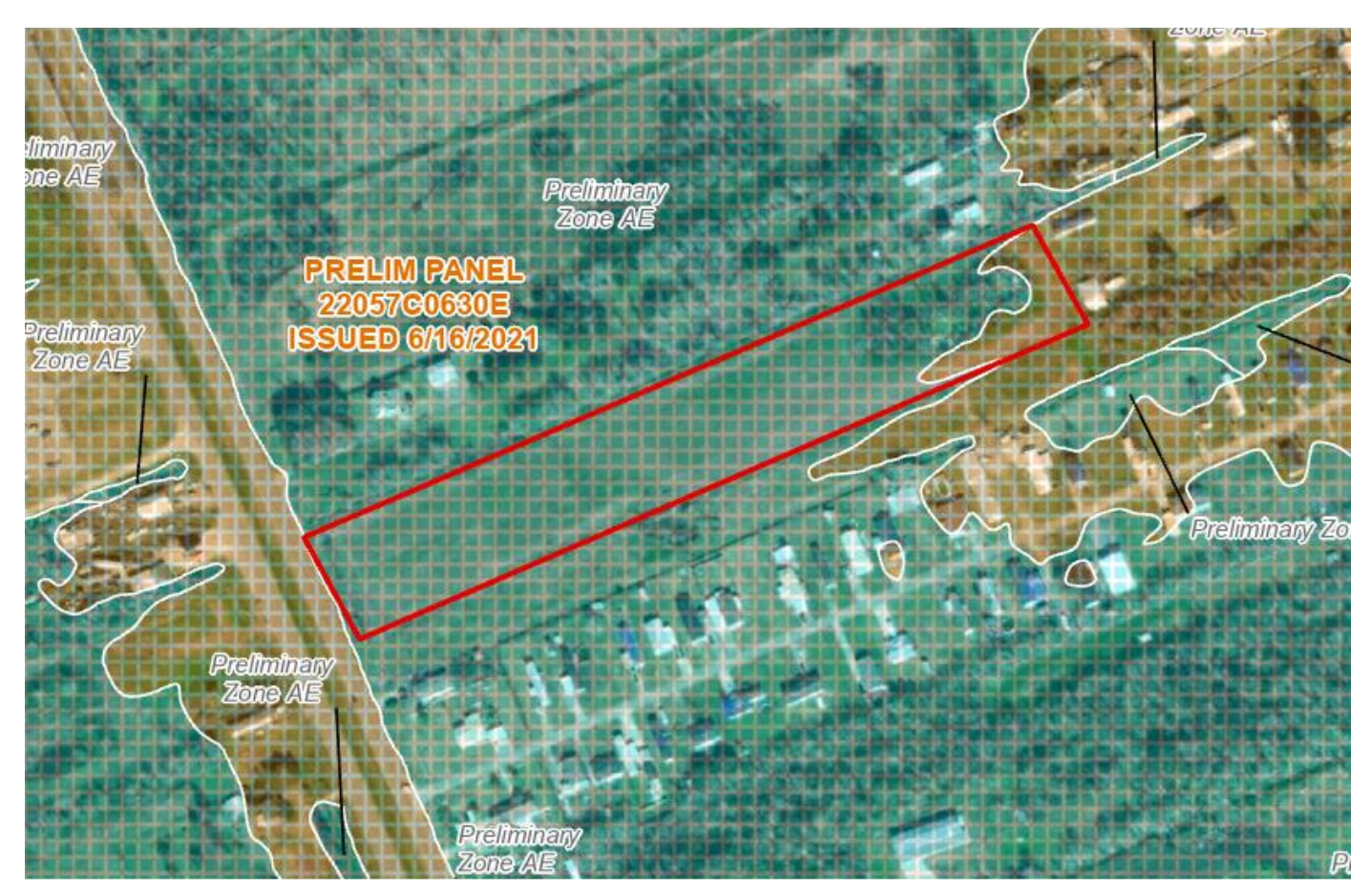
Figure 3: Triche Flood Insurance Rate Map