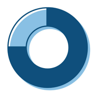
75% of Black small employers plan to take the COVID-19 vaccine when it becomes available

A survey conducted by Reimagine Main Street in 2021 discovered that: