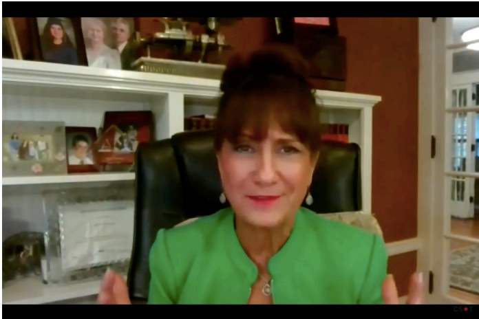
Rep. Marie Newman, D-Ill., on the ' "At the Virtual Table" show on July 16.